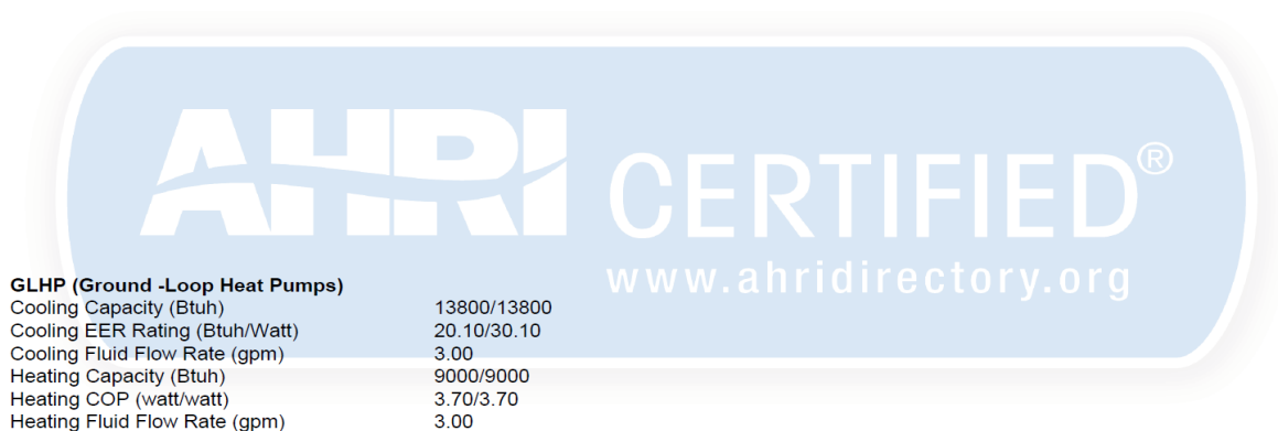
Figure 4: Geothermal AHRI Certificate

If equipment is being installed in non-standard temperatures, option B should be followed to calculate sizing ratio. The participating contractor will be required to submit manufacturer performance data at the specific design conditions. The AHRI method will apply in most circumstances.